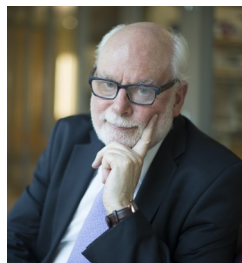
Sir Fraser Stoddart Northwestern University Department of Chemistry Evanston, IL 60208